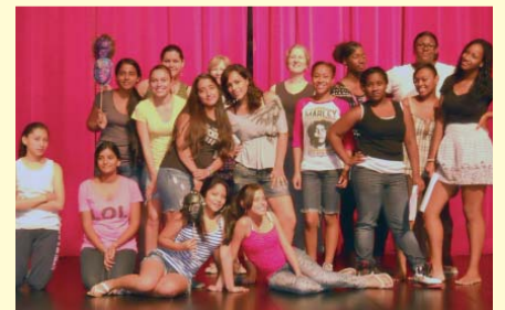
Girls Surviving, summer 2010

Since it began in 2005, Girls Surviving has directly served more than 50 girls in its summer and school-year programs. It has indirectly reached at least 150 more through outside workshops and community performances.