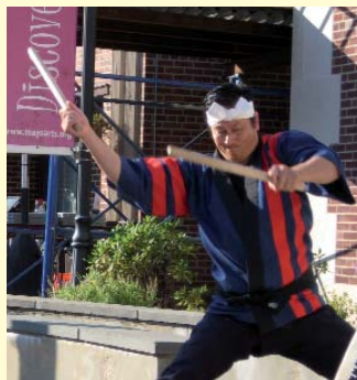
Taikoza artist in taiko drumming performance.