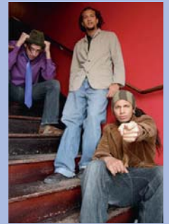
Clockwise from top: Arm of the Sea/Turtle Island Medicine Show; The Mayhem Poets; jazz guitarist extraordinaire, Frank Vignola; bluegrass artists Straight Drive; The Spirit Ensemble.