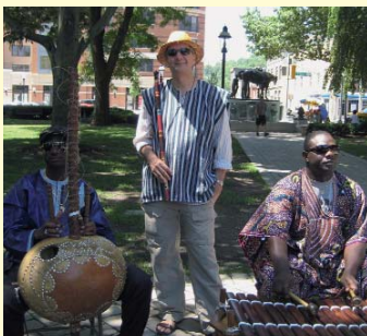
The Fula Flute Trio