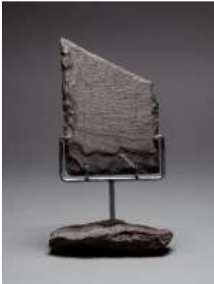
Anthropocene #8 (Coral 2)