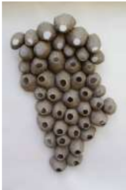
Nest Colony II