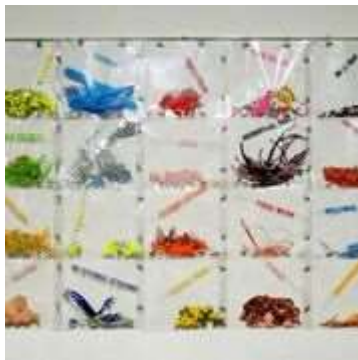
Scrapbooking Evidence Bags