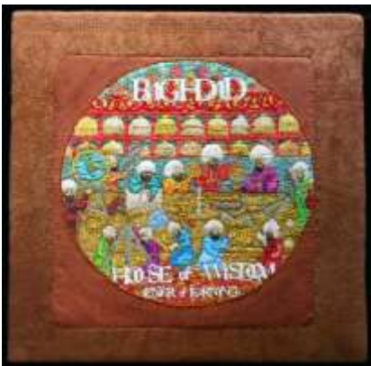
Baghdad House of Wisdom