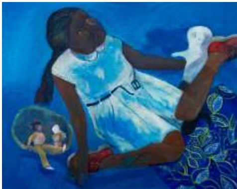
Red Buckled Shoe