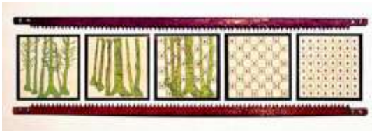
Study for Land Use