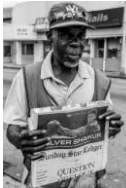
Shakur Stevenson Wins