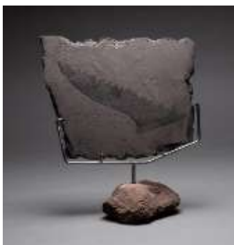
Anthropocene #7 (Jawbone)