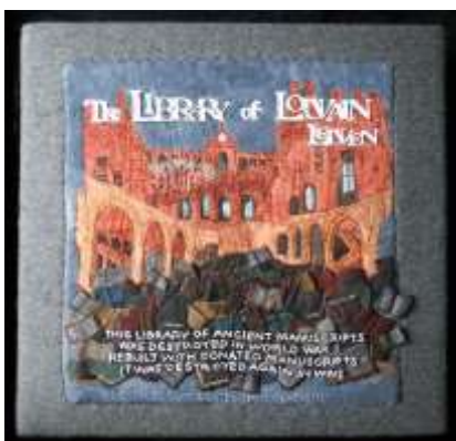
The Library of Louvain