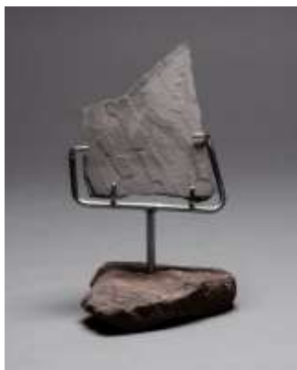
Anthropocene #9 (Crab Claw)