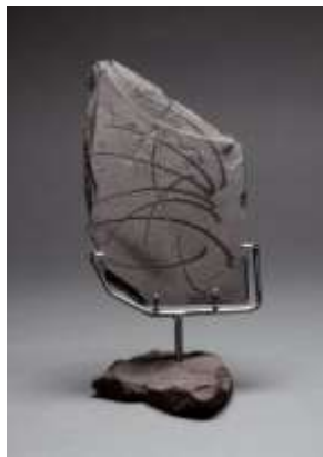
Anthropocene #10 (Rattlesnake Ribs)