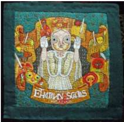
Ethiopian Magic Scrolls