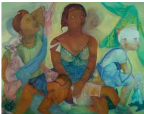
Pink Party Hat