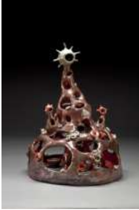
On the Edge of the Broken City