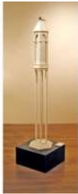
Tower of Extinction