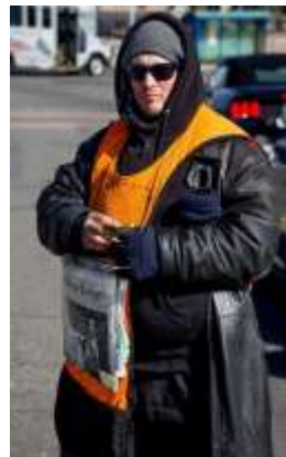
Springfield & Belmont