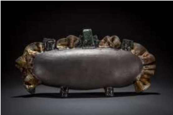
Filly Lidded Luster "Purse" Jar