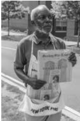
Loss & Remembrance