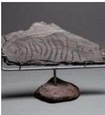
Anthropocene #6 (Wilted Fern)