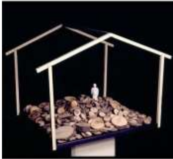
Goodbye Lot 6402