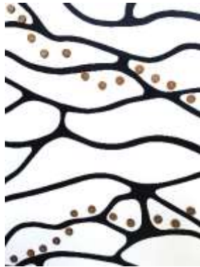
Other Forest Service Routes