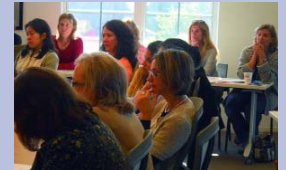
L-R: The Artist Residency Roundtable; the Fundraising Beehive