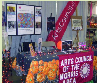
Arts Council booth at Morristown CraftMarket