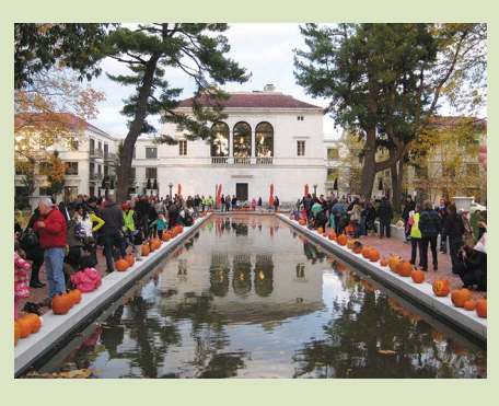
Clockwise: View of Vail Mansion reflecting pool with pumpkins; one of Dan Fenelon's masks; a Pirate Ship and "Despicable Me" pumpkins; Baby in the pumpkin spirit!