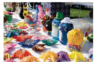
Above: Scenes from Meet Me in Morristown, 2019