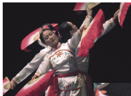
Clockwise from top: Nai Ni Chen Dance Company; Lustig Dance Theatre; The Mayhem Poets.