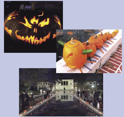
Clockwise from top: The "Great Pumpkin" from Grow It Green ; a "centipede" pumpkin; View of Vail Mansion with illuminated pumpkins.

Be a part of Morris Arts' 5th Pumpkin Illumination event. On October 26th, bring your carved pumpkins to the Vail Mansion's reflecting pool and monument at 110 South Street, Morristown where pumpkins will be lit and arranged around the reflecting pool at dark – making a wonderful display. Additional activities – including another second town location as well as connecting with a Morris Arts' Artist Residency program, are "in the works," so check our website, www.morrisarts.org for more details as they become available.