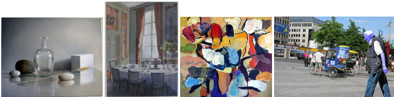
L-R: Elaine Kurie's oil, Glass Bottle with Wheat ; Fran Wood's watercolor, Set for Lunch in Bruges ; Mitchell Rosenzweig's oil, acrylic, multimedia Double Dome ; Peter Tilgner's merged image photo art, Blue Man (from Berlin series).

October 2, 2015 - January 7, 2016 Opening Reception on October 2, 2015, from 6:30-8:30pm