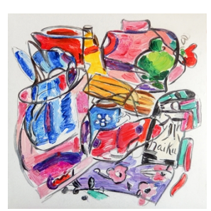
L-R: Marsha Solomon's works from the portfolio, From Rhythm to Form : acrylic on canvas, Calyx & Pink ; acrylic on Arches paper, Blue Green Hollow ; from the portfolio, The Edge of Color: acrylic on Arches paper, Interior #1 ; acrylic on Arches paper, Haiku .