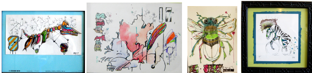
L-R: David Nicolato's works: ink and graphite, with Swarovski crystals on paper, Don't Let Go ; Acrylic and ink on canvas, Follow Me ; ink drawing on paper, East Bumble ; watercolor on 90lb paper, Racing Stripes #2

DAVID NICOLATO, 3 rd Floor Hallway/Elevator Lobby September 22, 2017-January 5, 2018