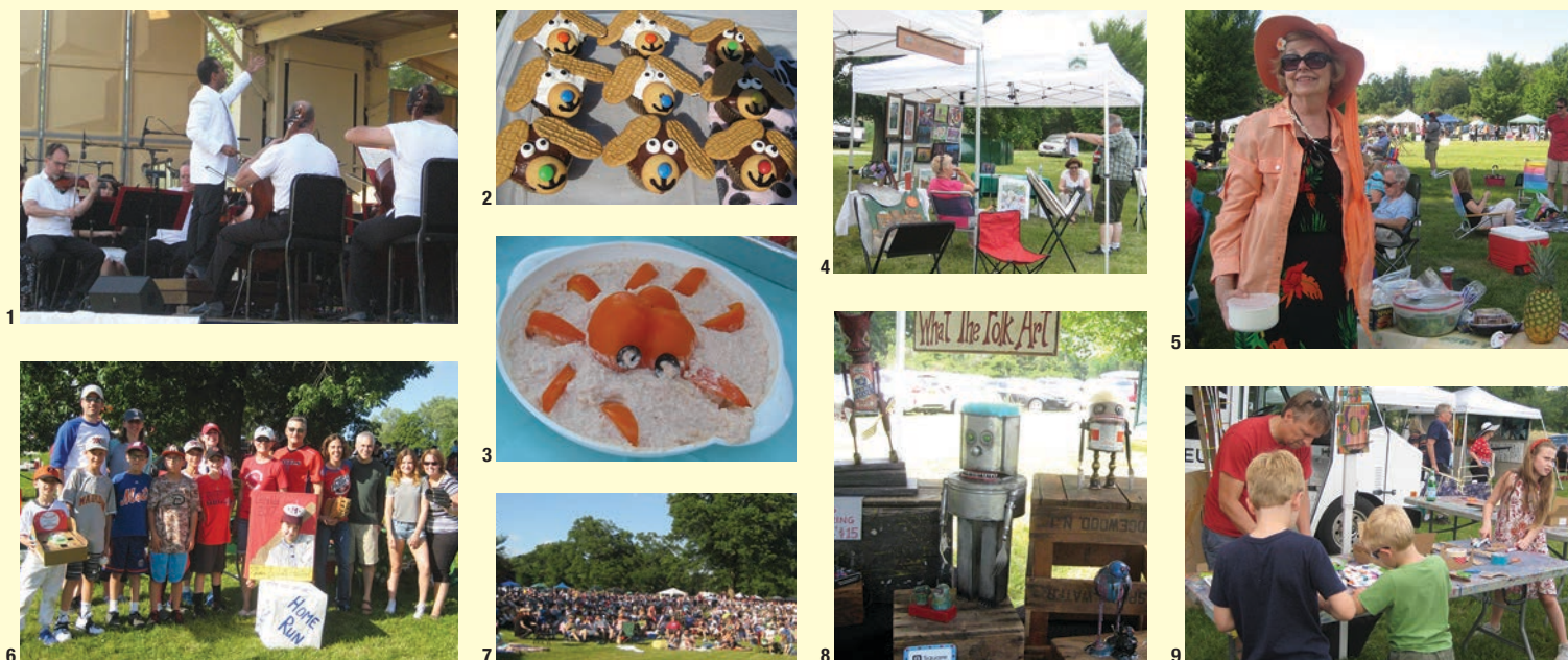
From top left: 1) Sameer Patel conducting the New Jersey Symphony Orchestra, Giralda 2017 2 & 3) Culinary creations abounded – “doggie” cupcakes (from the “Dog Days of Summer” picnic) and an “octopus” salad (from the “It’s a Shore Thing” picnic) 4) A sampling of the art show and sale 5) Kay Kribs brings millinery style to the “Hula Baloo” picnic group 6) Multiple families participated in a prizewinning baseball-themed picnic 7) Happy crowds relax and enjoy the great music 8) Some of the creatures at the What the Folk Art tent 9) Art making activities for kids with artist Dan Fenelon at the Montclair Art Museum truck.

(see page 3 for more information and ticket pricing)