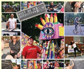
Scenes from Meet Me in Morristown

Me in Morristown, bringing the arts to the Morristown business district. During early evenings on the last Thursdays in May, June, July, and August, between 30-44 selected visual artists and musicians set up shop, showcased and sold their art or performed live throughout the town while various Morristown businesses operated sidewalk sales. Acoustic music played along the sidewalks while amplified "headliner" bands (Secret Sound, Atlanta Café, The Outcrops and The Break Lights) performed on the Green. The event drew people to Morristown to sample the live arts experiences, great shopping and delicious dining in Morristown. Kudos to all the organizers!