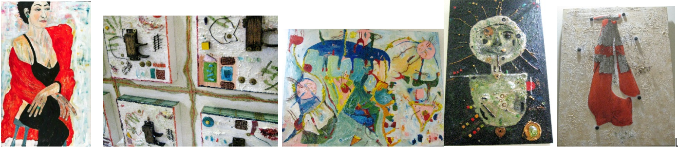
R: Ruth Bauer Neustadter's works: acrylic, Woman Wearing Red Cape ; Detail from multimedia work, Six ; acrylic, Dreamscape ; multimedia/found objects work, African God and multimedia work, Wired .

Driven by an archeological, environmental and political urgency, I travel through life discovering discarded materials which I am inspired to transform into meaningful and provocative works of art.