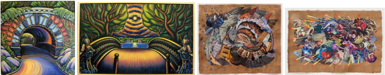
L-R: Works by Bascope: oil, Inscope Arch ; oil, Southwest Reservoir Bridge, Central Park ; collage/photographs/drawing on hand made paper, Outerbridge Crossing ; collage/photographs/ drawing on hand made paper, Star Maps .