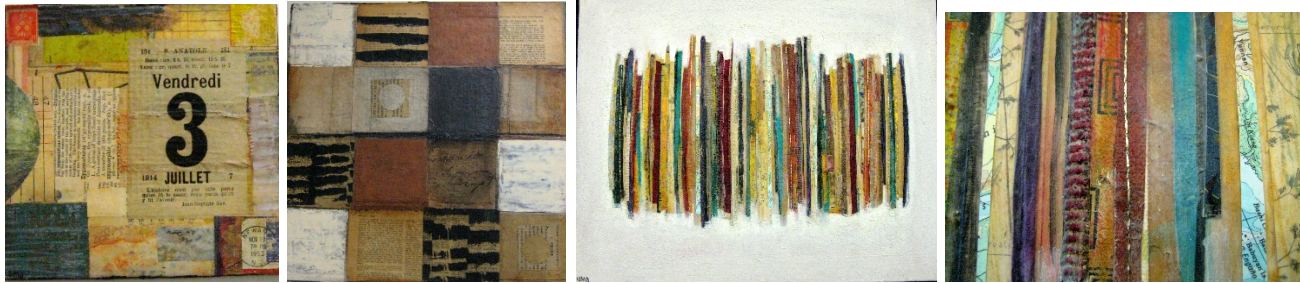
L-R: works by Betsy Meyer-Donadio: Mixed media on board, 3; Mixed media on canvas, Grid Series 2 ; Mixed media on canvas, Confluence ; Detail from mixed media on canvas, Confluence .