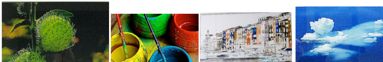
L-R: Ouch!-NY Botanical Garden ; Paint Pots- Havanah, Cuba ; The Harbor-Cinqueterre, Italy ; Breaking away, glacial ice field, Chile.