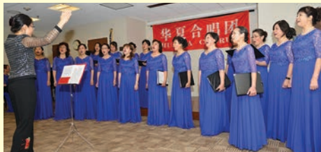
The Huaxia Chinese Chorus