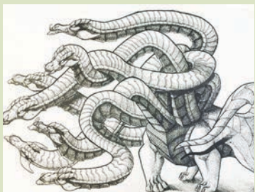
Artwork and mentoring students at work in Morris Arts' Young Artist Mentoring Program at Morristown High School, Morristown, NJ.