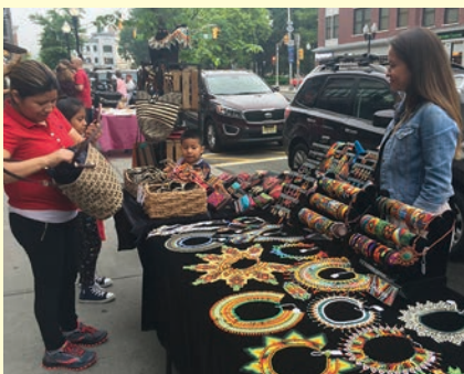
Scenes from Meet Me in Morristown, 2018.