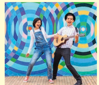
Clockwise from Top Left: The Number Drummer; Sonnet Man; 123 Andres; Shakespeare LIVE – Shakespeare Theatre of New Jersey.